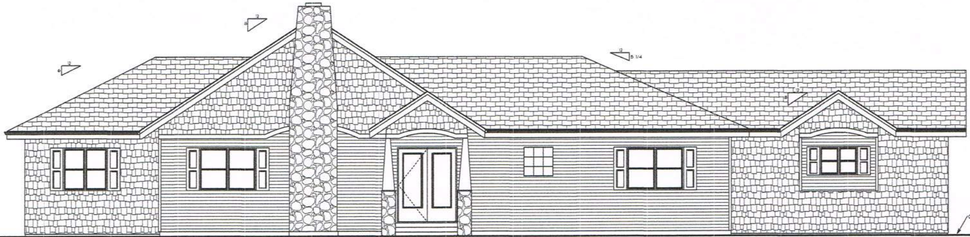
FRONT ELEVATION SCALE 1/4" = 1'-0"